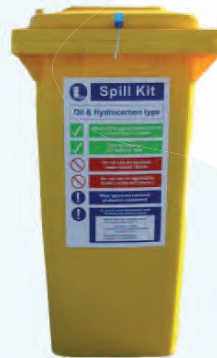
Spill response kit

An example is the free sewage pump-out facility we now have available through a partnership with the Auckland Regional Council. Simply contact the team at Customer Services for details.