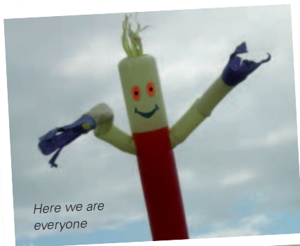
Here we are everyone