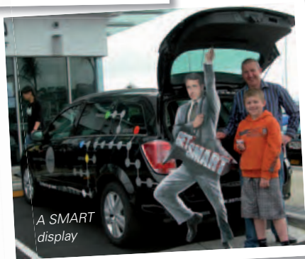
A SMART display