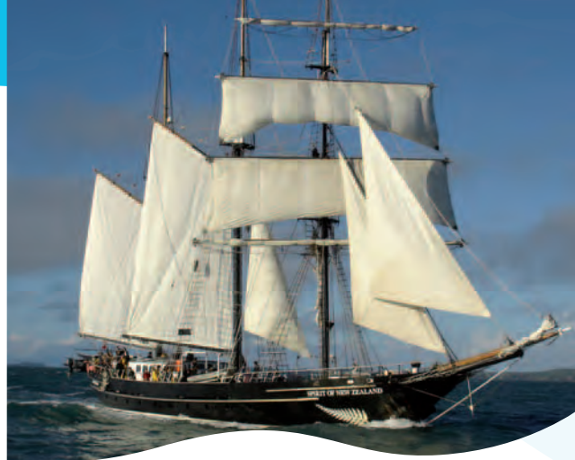
Voyages: All depart and return to Auckland