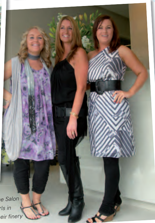
The Salon girls in their finery